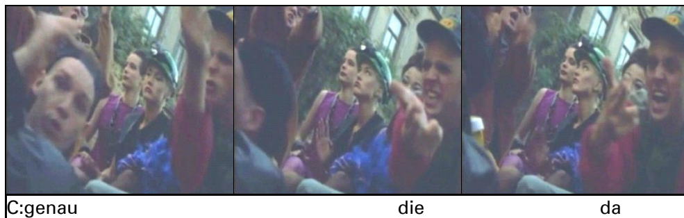
Fig. 5 4

In another image sequence (fig. 5), there is a special case illustrating the additional value of the camera perspective. The deictic clues (gaze and gesture) of the person in the right part of the picture are nearly referencing the center of the image.